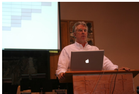
Pictured here is Dr. Bruce Perry lecturing on the process of Brain Mapping during the training “The Impact of Trauma and Neglect on the Developing Child,” held in Susanville, CA.

There were 350 people who attended the event for the six hour training by Dr. Perry who graciously answered all questions, autographed books and took photos with many participants. This was the second annual community educational event hosted by the Lassen County Public