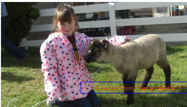
A picture from “Fun on the Farm”

Resource Center held a Candlelight Vigil, which was a great way to raise awareness of child abuse. The Mt. Shasta Children’s Choir also performed at this event.