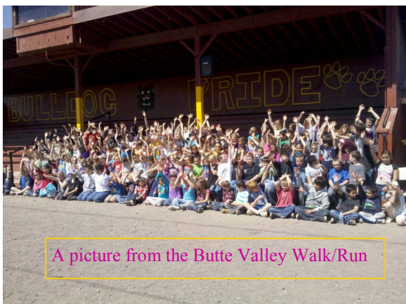
A picture from the Butte Valley Walk/Run