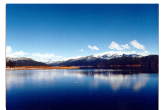
Trinity Lake, Trinity County

The younger brother works with me during reading time. He is also capable of the work, needing quiet time and support. I let him verbalize any questions and have freedom of movement. Both of these boys profit from the support that only 1-on-1 working can allow. They get so excited when they complete their work and realize they are capable.