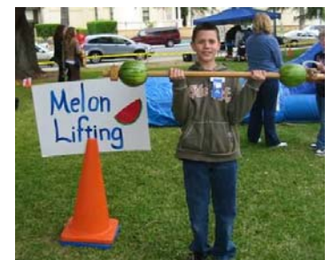
8th Annual Children and Family Fair, Glenn County

servers carrying fruit baskets never made it through the entire event without returning to the kitchen to fill up again! This annual event is hosted by the Children's Interagency Coordinating Council (CICC), but it would not have been as successful this year without the assistance of Sierra Cascade Regional Network and their local partners! Thank you for your support!