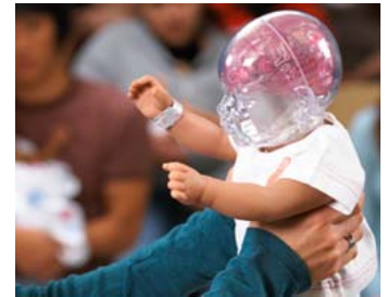
(SBS Simulator Doll)

These Child Abuse Prevention Council's (CAPC's) are now strategizing for another year of campaigning this issue.